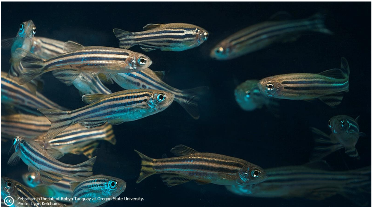
Figure 1 Danio rerio