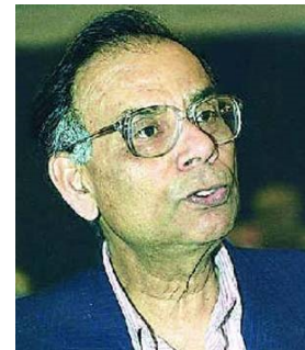
Ananda Mohan Chakrabarty

These are the most important users of gene modification but also parts of Africa.