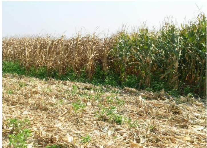
Undesired gene exchange can lead to different times of ripeness. Therefore more work and a less stable income for farmers.

Everybody would have to even if some people didn't want to (big profit for companies who produce the plants and farmer's dependence).