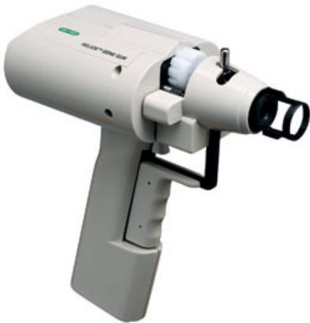
The Gene Gun

into an organism, this process is called transformation the gene gun (plants) or