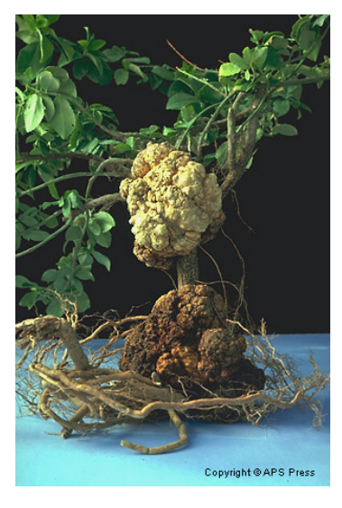
Image 1; the work of agrobacteria - they cause a plant to grow tumor-like structures

In order for the bacteria to transport the gene, the plasmid of the bacteria is removed, then the T-DNA is cut with the help of restriction enzymes<sup>2</sup>. The desired gene is extracted from another species and is also cut by restriction enzymes.