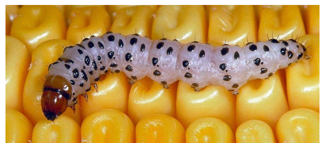
Figure 1: Ostrinia nubilalis

impressive. As Bt-corn is obviously secured against pests like the European corn borer (Ostrinia nubilalis, see picture to the right), other plants, for example the previously mentioned "offsite crops", are not. Pests as the corn borer are not solely harmful to corn but also to numerous other crops. And that's