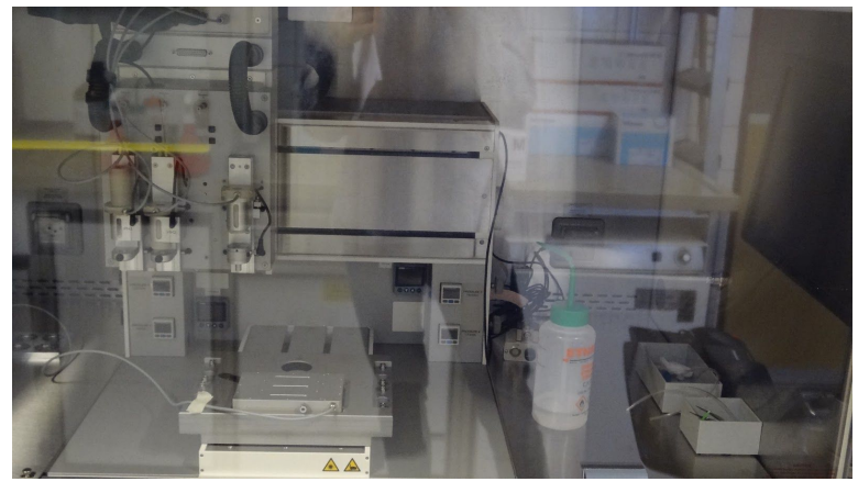
Fig. 5: Inside of a cell 3D printer (AELEN 2018)